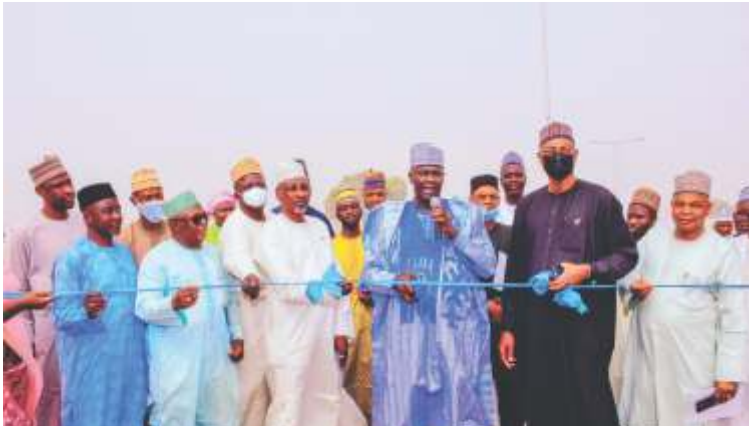
A scene of commissioning of road network by representative of Minister of Works & Housing

While commissioning the road, the Minister of Works and Housing, Mr. Babatunde Raji Fashola, SAN who was represented by the Federal Controller Works, Kano, Engr.