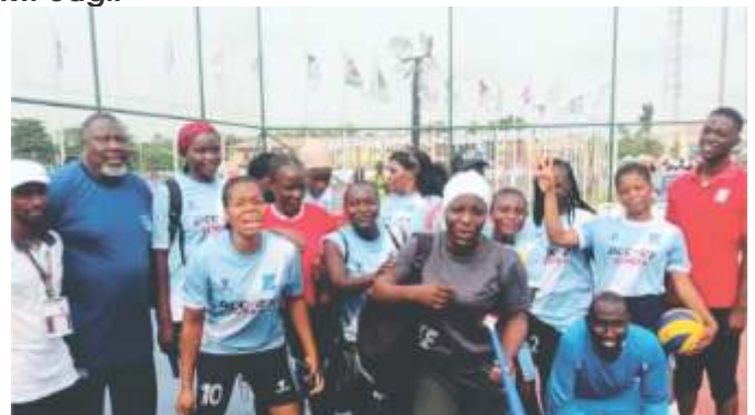
BUK female volleyball players when they qualified to the semi final of NUGA games

The athletes, coaches, and members of sports consultative committee appreciated the kind gesture of the Vice Chancellor for providing all the necessary logistics that boosted the moral of the athletes and staff.