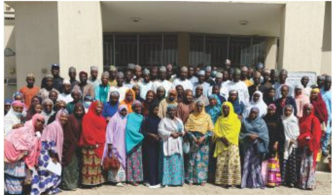
Members of the ACEPHAP team in a group photograph

recognize hard working staff who distinguished themselves during the implementation of the Centre's research grants. She also disclosed that some of the researchers who would soon leave the centre due to the conclusion of the research project would also be celebrated.