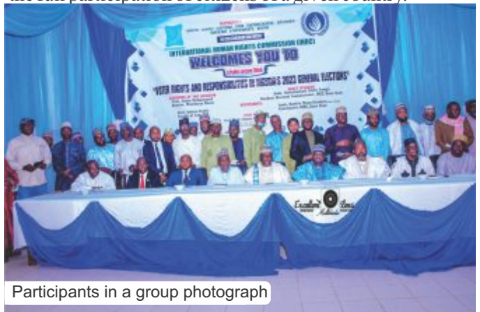
Participants in a group photograph