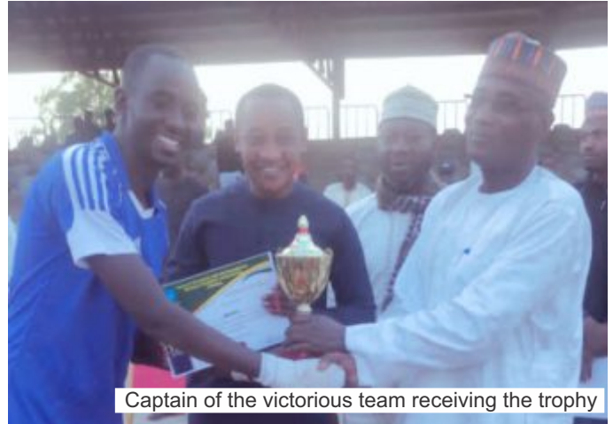
Captain of the victorious team receiving the trophy

for their well-deserved victory. He urged the Students Affairs Division to collaborate with the Sports Directorate to organize such competitions between faculties, adding that competitions such as this would enhance relationships and at the same time scout talents that would represent the University in external outings such as NUGA and WAUG.