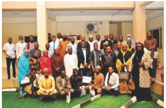
The retreat participants in a group photograph