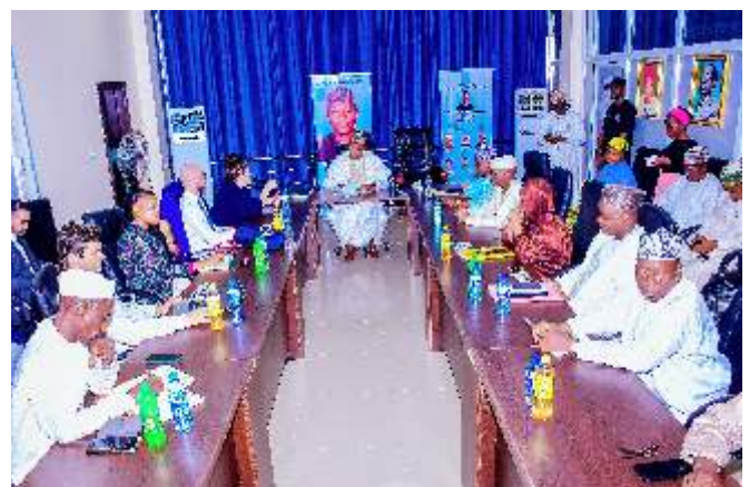
A scene of the discussion between University Management and French Ambassador to Nigeria

She spoke about the e- health program on early detection of malaria which is being funded by French Government, describing it as an important project which would be followed through.