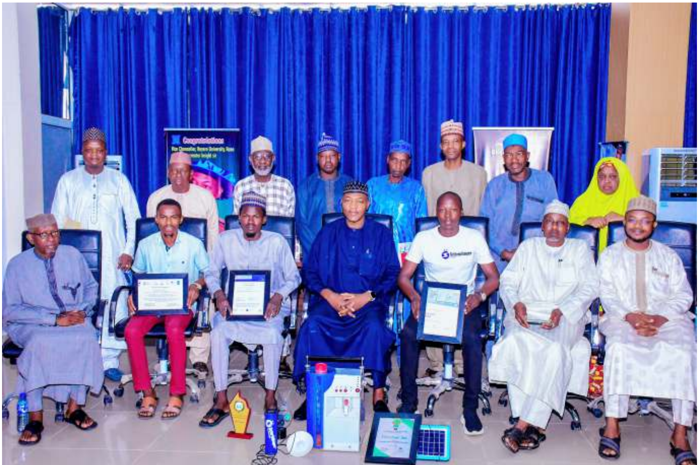
Student inventors displaying their certificates in a group photograph with the members of University Management