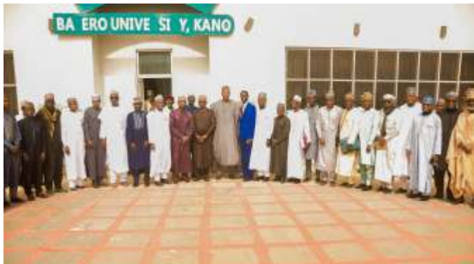
Members of NUC accreditation team in a group photograph with Management of Bayero University, Kano

Bayero University, Kano (BUK), welcomed five accreditation teams from the National Universities Commission (NUC) on Monday, 16th December 2024, to evaluate eight academic programmes, bringing the total number of accredited programmes in the university to 52. The teams were received at the Senate Chamber.