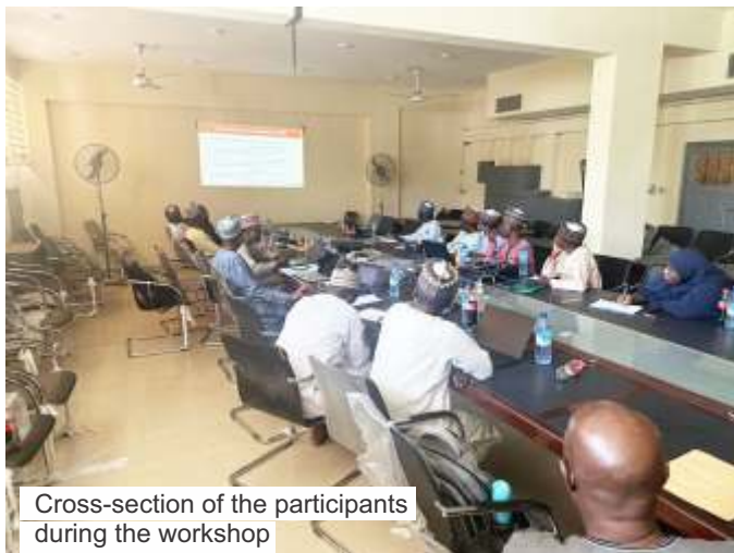
Cross-section of the participants during the workshop

The Faculty of Engineering held a one-day training workshop on COREN Outcome-Based Education (OBE) accreditation on Thursday, 24 th October 2024 at the Faculty Conference Room. The event, which focused on equipping departments with the knowledge and tools required for successful accreditation, brought together key