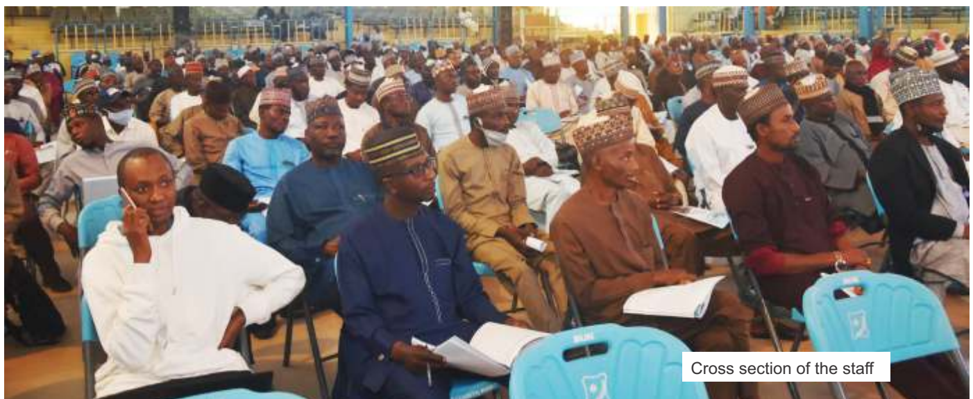
Cross section of the staff