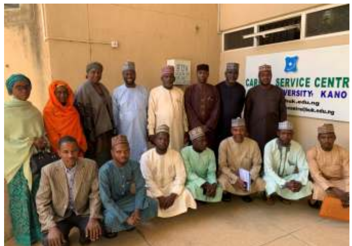
Dean Students Affairs with the Director Career Service Centre and Staff of the deanery