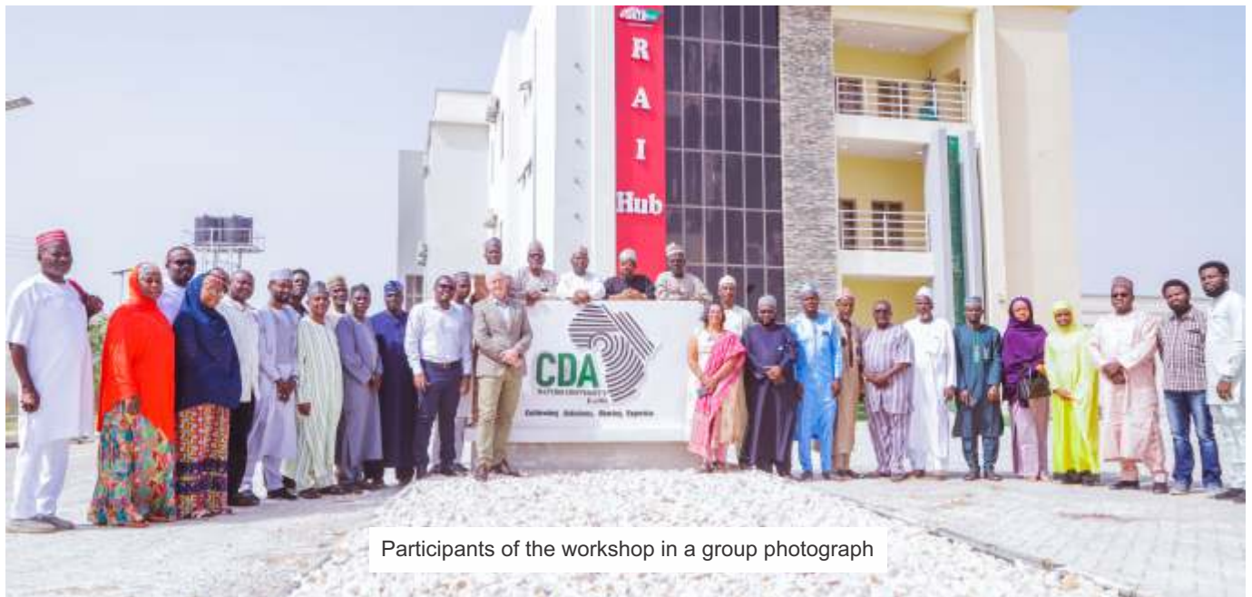
Participants of the workshop in a group photograph