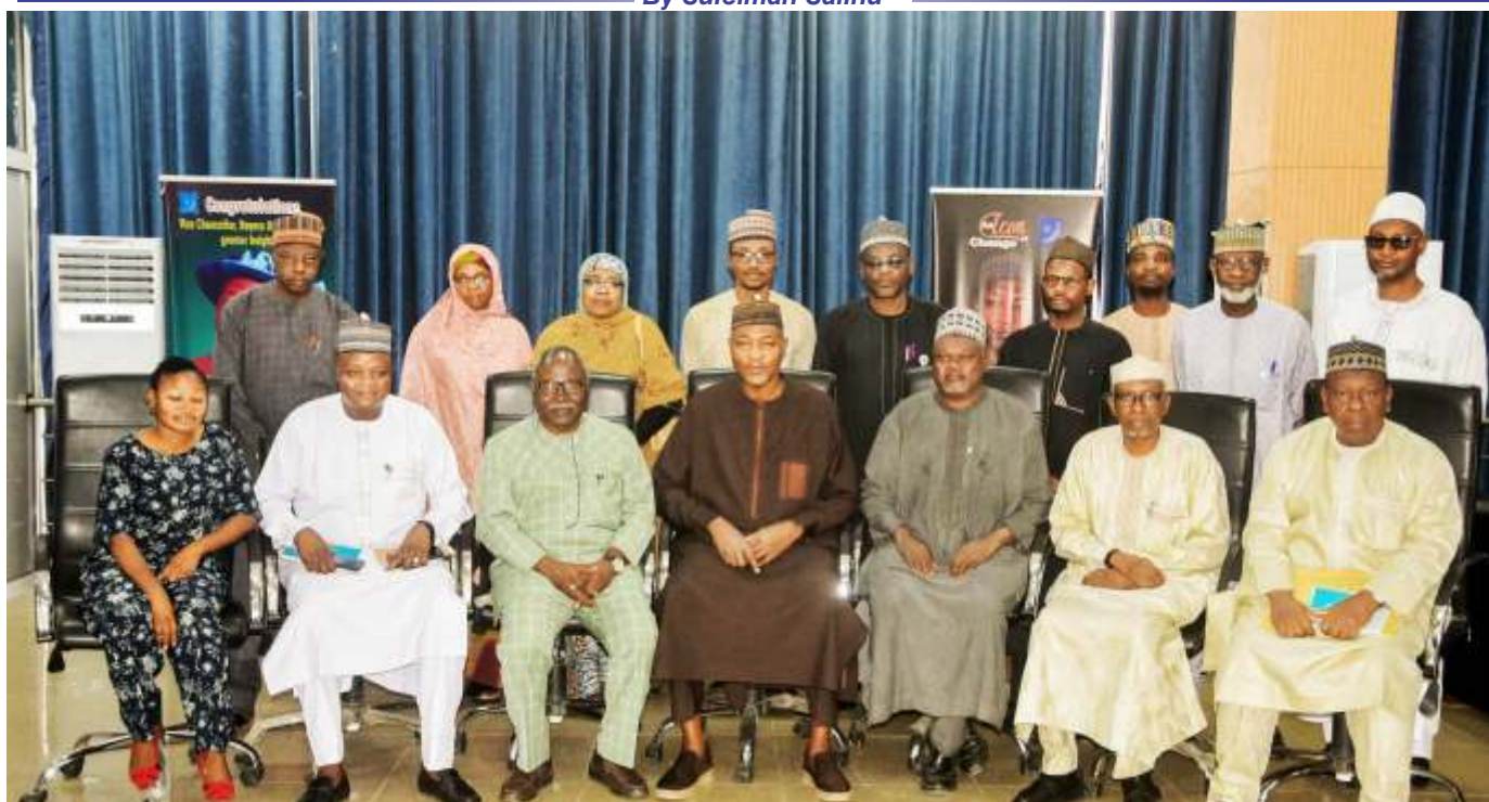
Members of the NUC Accreditation Team in a group photograph with BUK Management

National Universities Commission (NUC) accreditation teams visited Bayero University, Kano (BUK) for accreditation exercise. The visit took place on Monday, 18 th November, 2024.