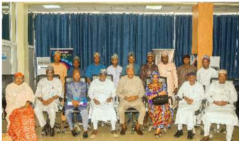
Members of NUC Accreditation Team in a group photograph with University Management of Bayero University, Kano