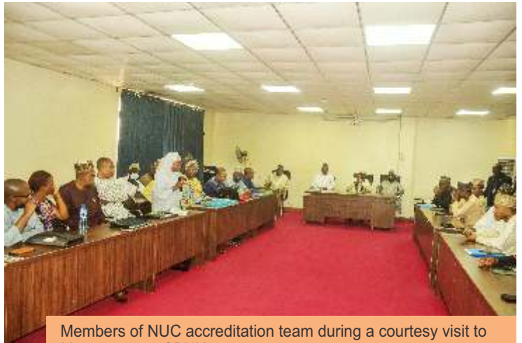
Members of NUC accreditation team during a courtesy visit to Management of BUK

The NUC team would review the following programs; BSc Political Science, BSc Zoology, BSc Biochemistry, BSc Geography and BSc Meteorology.