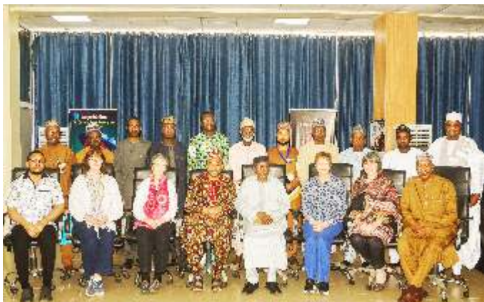
The Team from Kings College, London in a group photograph with BUK Management