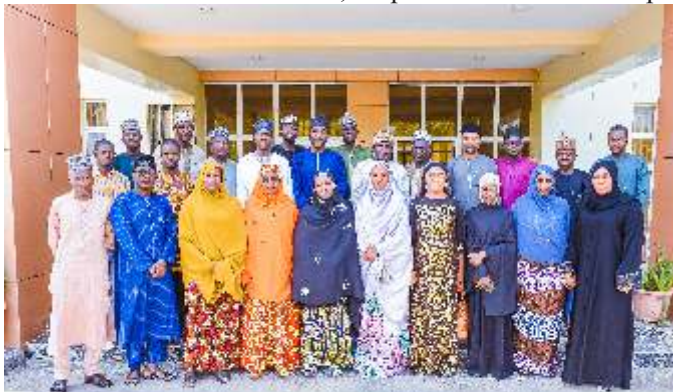
A group photograph of administrative secretaries participated in the training