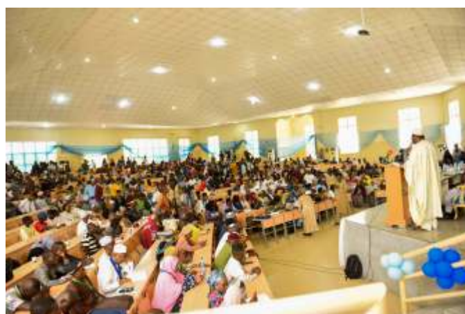
Cross section of participants at the CSN conference