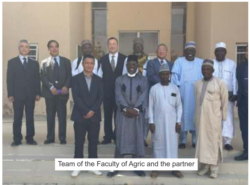
Team of the Faculty of Agric and the partner