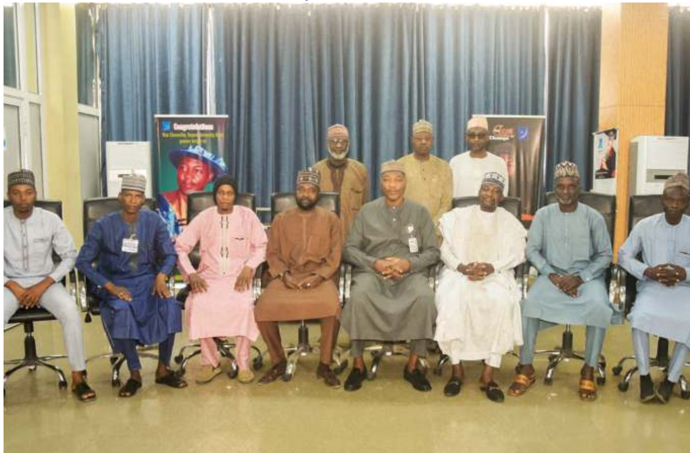
Members of Numerical Optimization Research Team in a group photograph with Vice Chancellor

The Numerical Optimization Research Group is one of the top international research group domicile in the Department of Mathematical Science, Bayero University Kano with 45 memberships across most higher institutions within and outside Nigeria. The group visited Bayero University Kano on Tuesday, 7 th January, 2025.