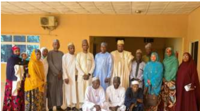
Participants of CL4STEM Project Scaling and Curriculum Mainstreaming Meeting in a group photograph