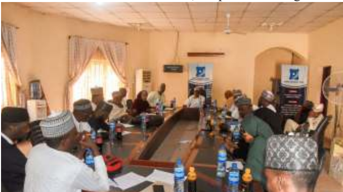
Staff of the SERVICOM Directorate during and interactive session with Management of School of Continuing Education (SCE)

The session provided an opportunity to outline SERVICOM's core functions, explore strategies for