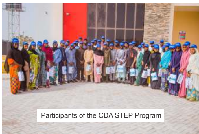
Participants of the CDA STEP Program

He concluded by encouraging participants, stating, "Your innovative ideas, energy, and resilience are instrumental in transforming our agricultural landscape and driving national development."