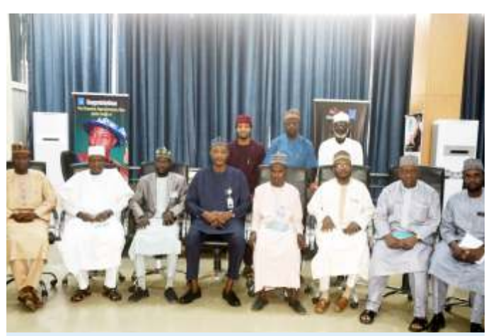
Members of MSSN Shura Council in a group photograph with BUK Management

The Shura Council of the Muslim Students Society of Nigeria (MSSN), Bayero University Kano (BUK) Chapter, paid a courtesy visit to the Vice-Chancellor on Tuesday, January 7, 2025. During the visit, the council expressed their heartfelt appreciation to the university management for its unwavering support, which has significantly contributed to the society's