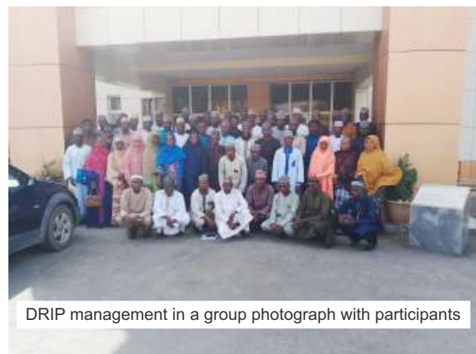
DRIP management in a group photograph with participants

The Directorate of Research, Innovation and Partnership (DRIP), at Bayero University, Kano, (BUK) has organized a